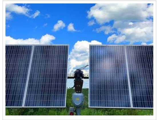
TDP 2.0 TURNKEY SOLAR TRACKER With BalanceTrac