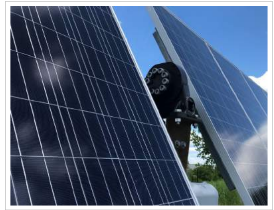
TDP 2.0 TURNKEY SOLAR TRACKER With BalanceTrac