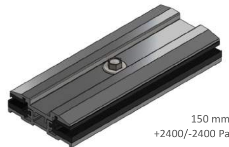
150 mm +2400/-2400 Pa